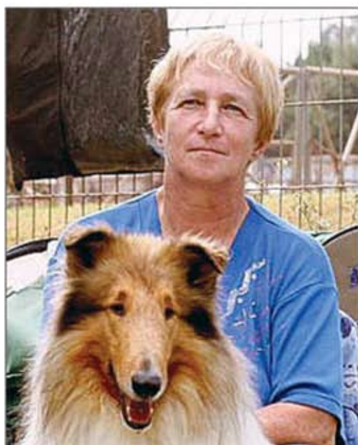
This lassie came home.

But memories of Israel reached out to her. She kept remembering a particular ride on horseback through the Jerusalem forest. She had stopped along the way to eat figs straight from the tree.